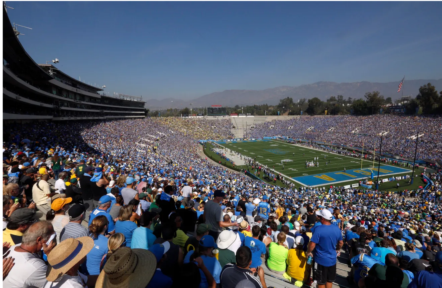
UCLA plays Oregon during a Pac-12 college football game at the Rose Bowl in Pasadena, Calif., Oct. 11, 2014.